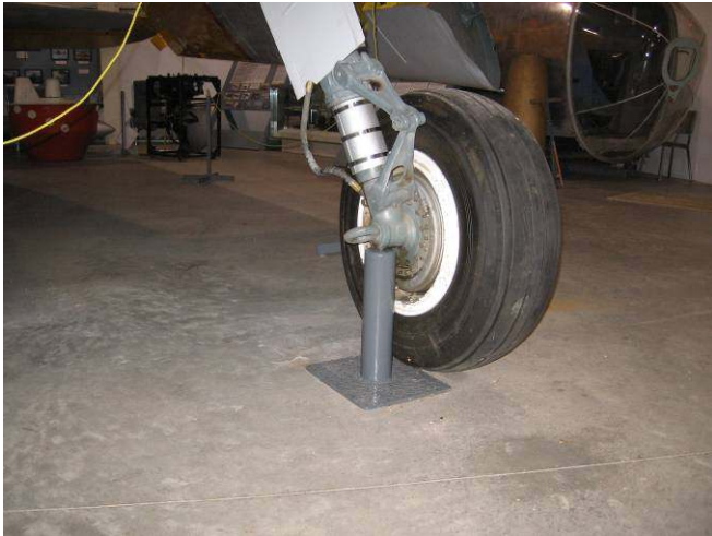
Support for the TBM