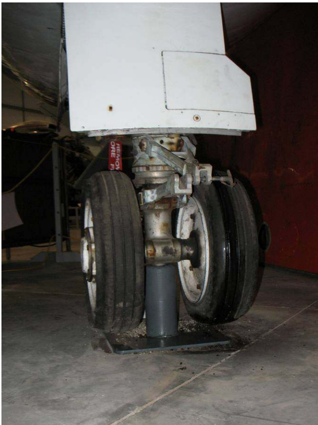
The Jetstar nose wheel with support

A major development in ACAM’s efforts to provide its members and the public with the best possible sources of Museum information is the revision of its Website.