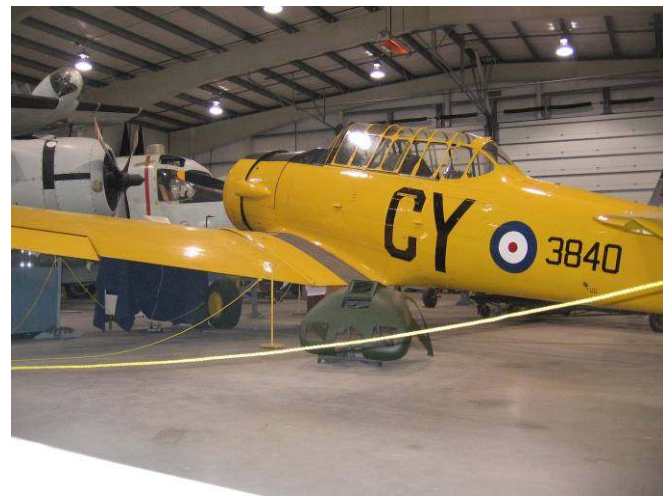
North American Harvard II

Each application requires that the aircraft be carefully raised and lowered onto the supports – an effort that involves anyone available.